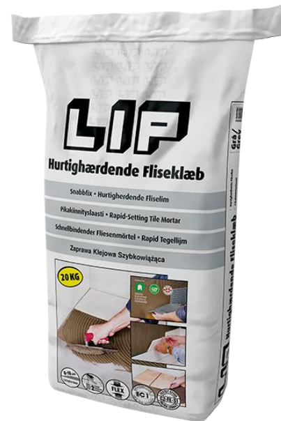
LIP Rapid-setting Tile Adhesive