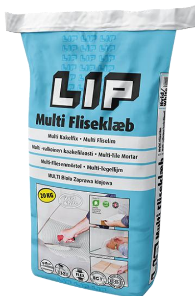
LIP Multi Tile Mortar - White

UN CPC code: 3733 - Refractory cements, mortars, concretes and similar compositions N.E.C.