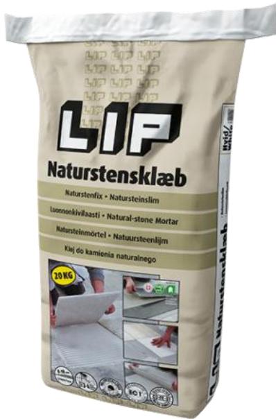
LIP Natural Stone Mortar