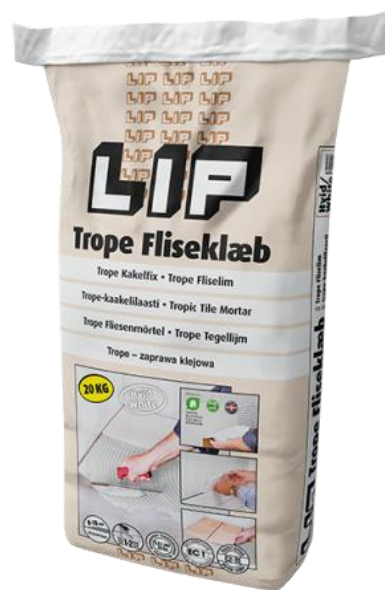
LIP Tropic Tile Mortar - White

UN CPC code: 3733 - Refractory cements, mortars, concretes and similar compositions N.E.C.