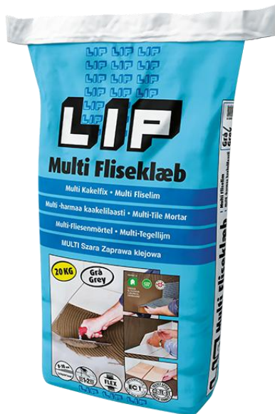
LIP Multi Tile Mortar - Grey